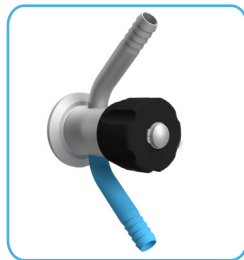
Hose Barb Ø12.7 x 1.65mm