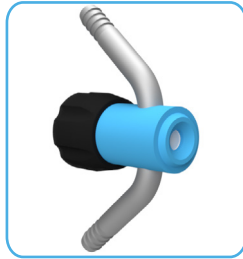
Butt Weld Ø26mm