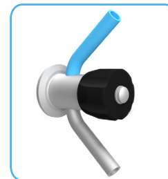
Butt Weld Ø12.7 x 1.65mm