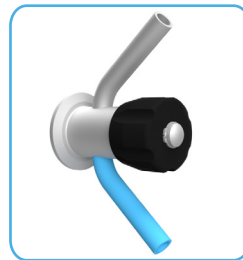
Butt Weld Ø12.7 x 1.65mm