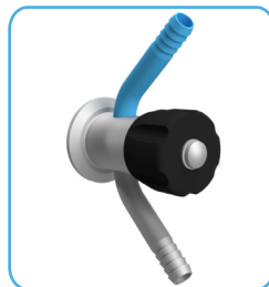
Hose Barb Ø12.7 x 1.65mm