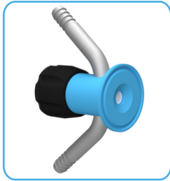
3/4" Clamp ASME BPE/BS 4825