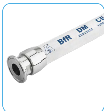
Re-Flex reusable hose clamp connection