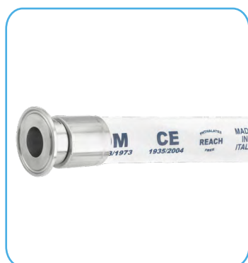
Silicone flexible hoses TusilPure